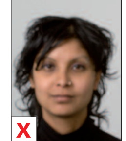
D. Insufficient contrast (pale)